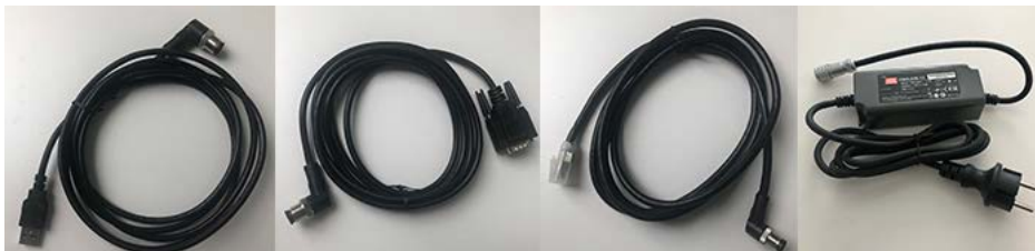
Cables included 2 meters length each